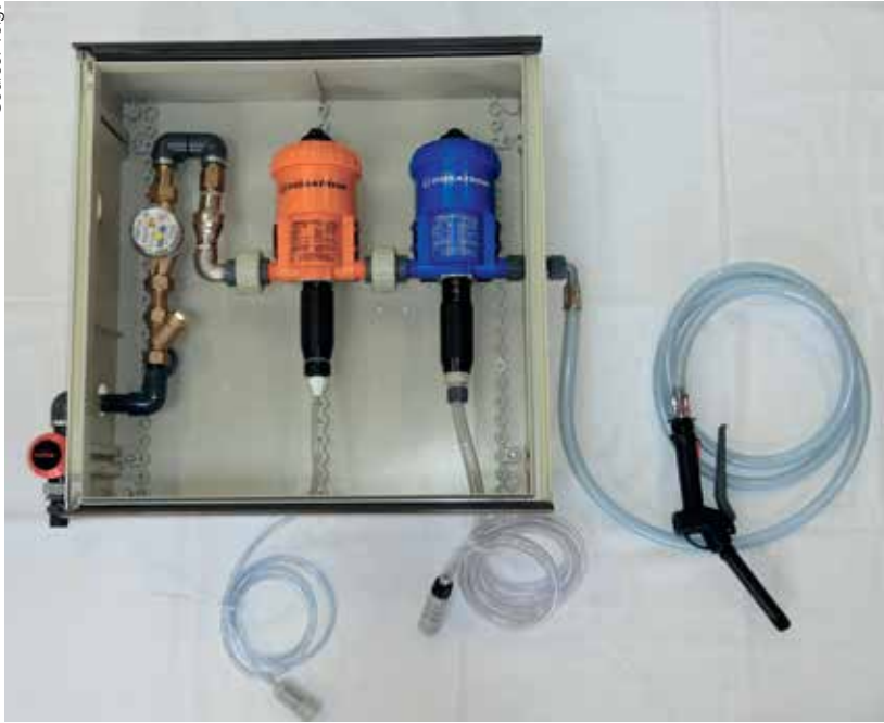
A DT Dosatron dosing cabinets for two concentrates.

tentially explosive atmospheres as well as FDA certification for food safety applications.